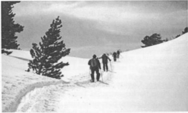
The boys skinning up to White Wing