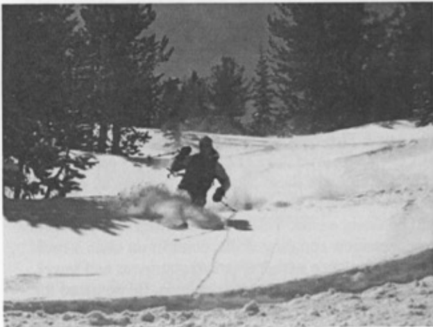
April Fool's Sierra Pow!!

In our base camp motel room we sampled fine beers with mike's wife's home made pasta and then crashed out ready for the next day's attempt of San Joaquin Peak's east faces.