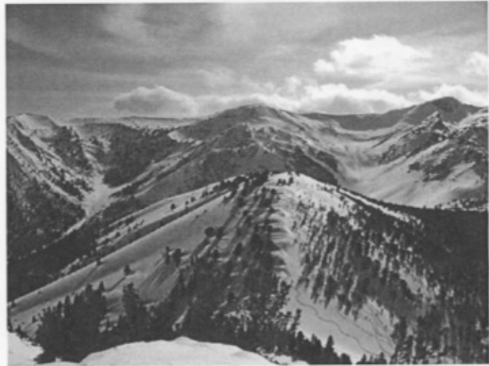
Tracks in the powder on the lower slopes. San Joaquin ridge in the background