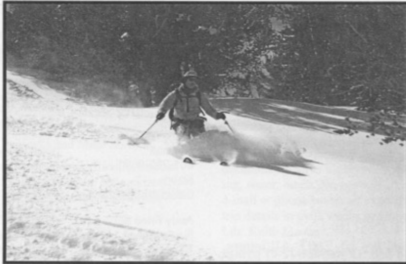
Randy rips 'em, classic hat and all