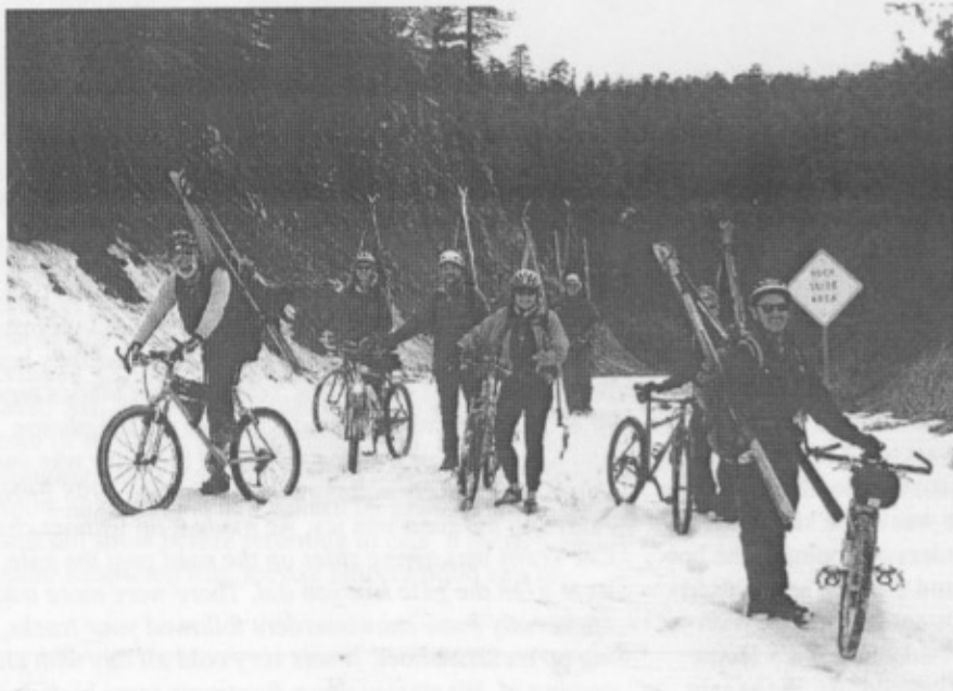
Mountain bikers stuck in the snow

to the large campground Campo Alto. In summer one can drive to the summit, but in winter it is 12-mile round trip cross-country adventure, made much nicer on skis. The picnic tables at the camp made for a nice lunch stop before we headed out to tour the flat-topped peak. We headed southeast out of the campground toward a radio tower and were pleased to find the Mt. Abel (8286') summit register under a pile of rocks, with views toward Reyes Peak and the Cuyama river valley below. We then headed toward the other nearby highpoint which looks up toward Mt. Pinos and down to the Puerta del Suelo (Gateway to the Bottom). In the 1800's, Spanish sheepherders used to run their sheep from Ventura to the San Joaquin Valley and graze them in the high country through this route. It is said that the missionaries blazed a cross on an old Jeffrey pine somewhere in the camp-