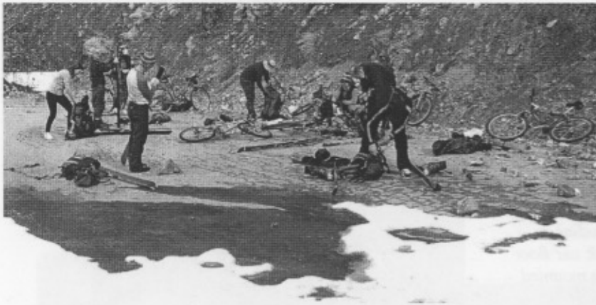
Switching from biking to skiing.

ground where they held mass for the shepherds, but we did not find the cross. However, the tour on top was pleasant and the sun stayed out for the rest of the afternoon. Back at the picnic tables, skins were removed and we started our descent the way we came.