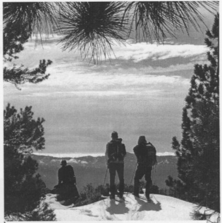
On the summit of Mt. Cerro Noroeste (Abel).

At the 7000' level, we skinned up through the mixed conifer forest of pinyon pine, Jeffrey & Ponderosa pine, and white fir. We headed up in a southwest direction on firm snow and then made our way south to access the sunny west ridge of Cerro Noroeste. By noon, we ascended the ridge