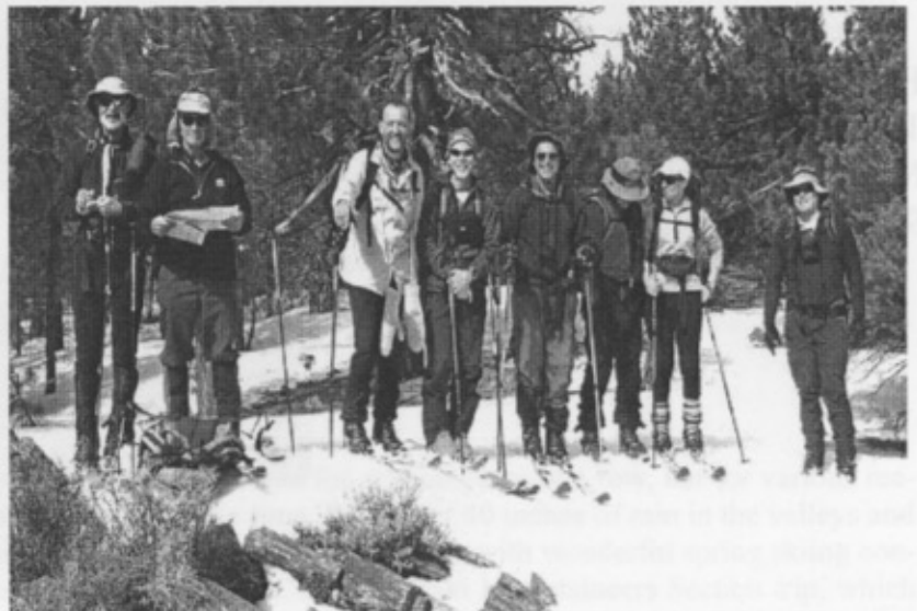
Finding the way