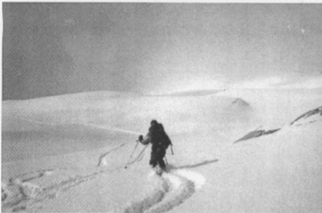
Skiing with ghostly fog coming up from the valley