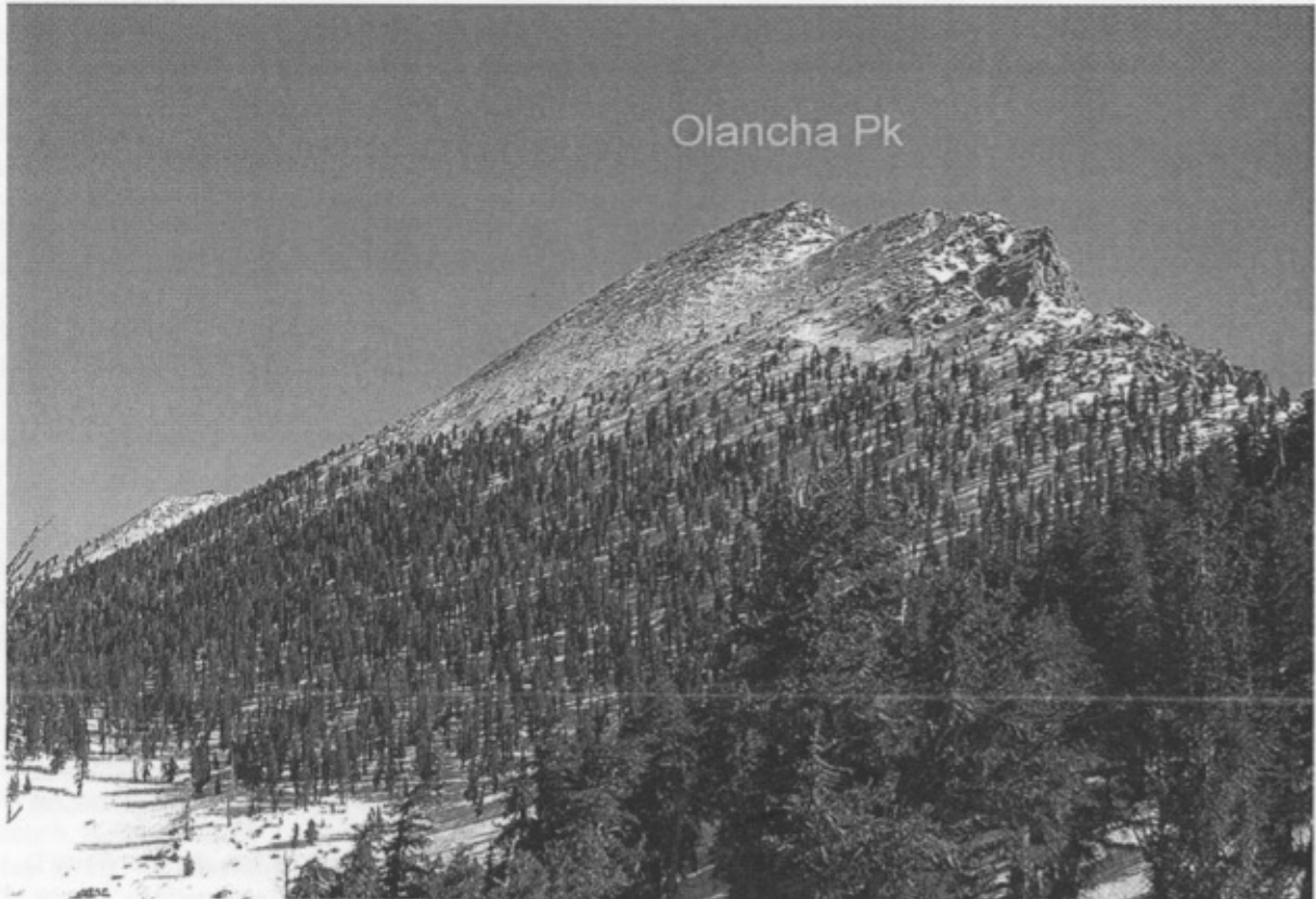
Olancha Peak from above Summit Meadows in winter