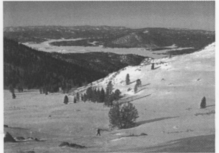
Descending the slopes below Olancha with Kern Basin in the distance