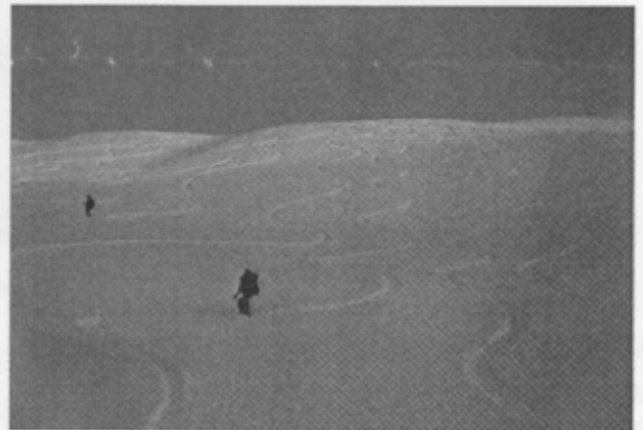
Skiers with powder tracks