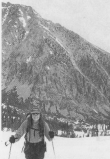
Climbing Robinson drainage with dry Kearsarge Pk in the distance