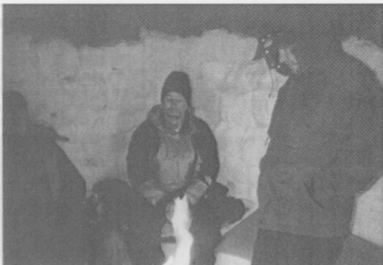
Above: Praying to the Wax God at camp