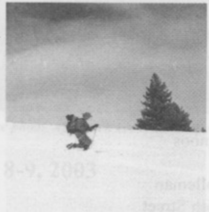
Sneaking in some turns . . .