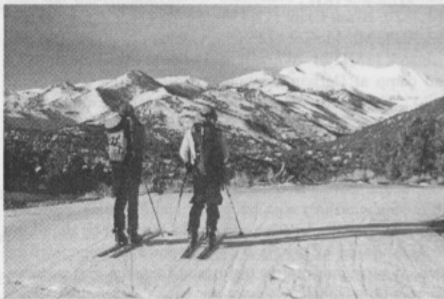
Contemplating the White Mountains from the Nevada side

12,100' saddle we recovered our skis and started down our >2000' ski run toward Trail Cyn.