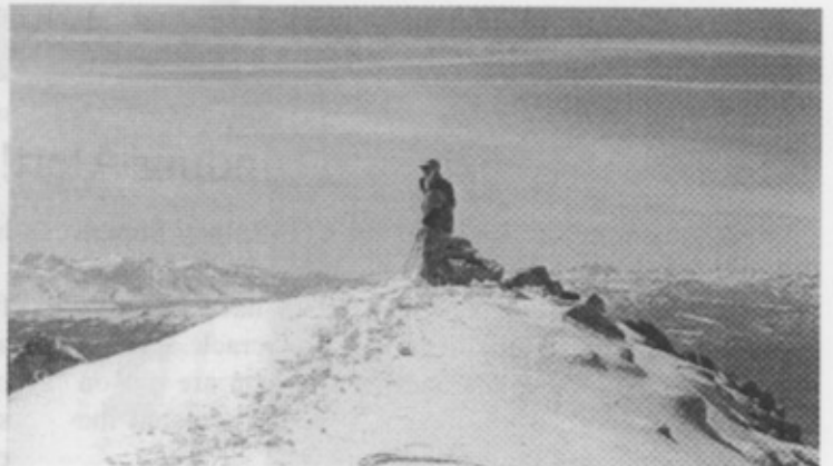
Stan on summit of Boundary Peak, with Sierra Nevada mountains in the distance—what a view!