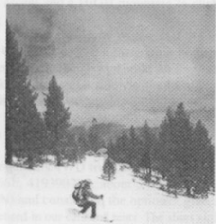
. . . before crashing in wet cement