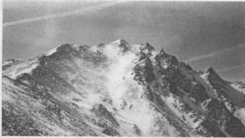
Jagged north face of Boundary Peak