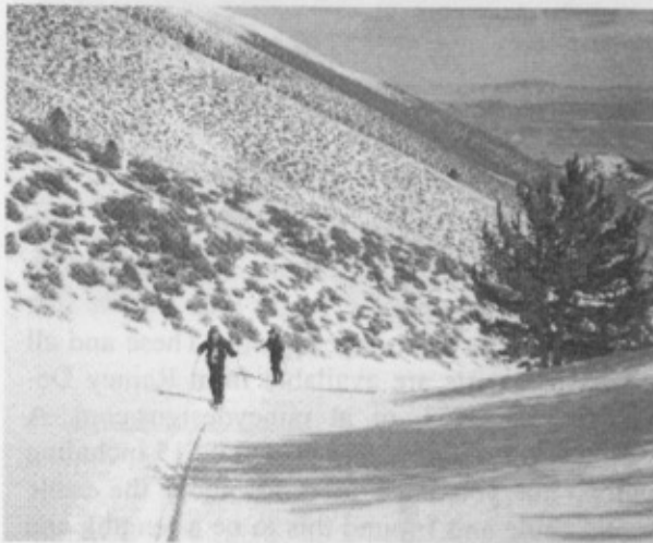
Climbing to Trail Canyon Saddle with Nevada desert in the distance