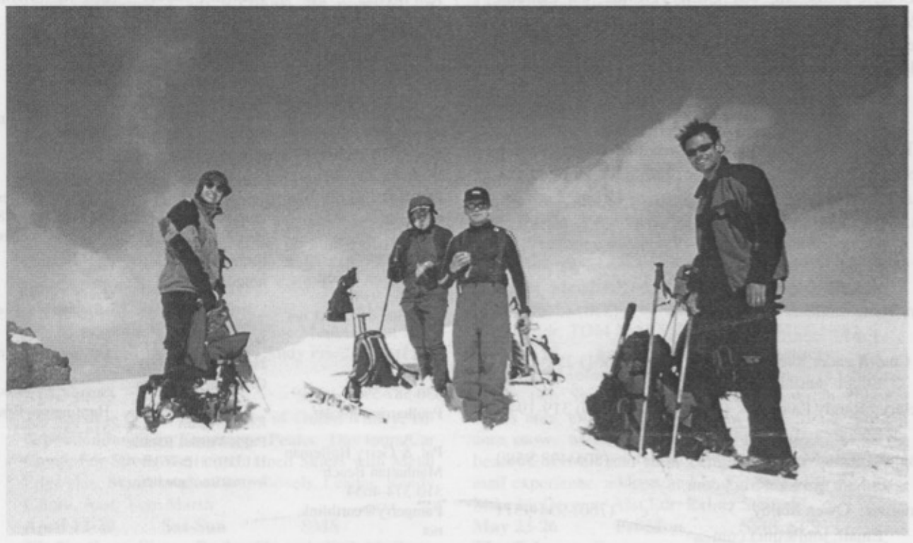
Group on summit of Kaiser "Junior"