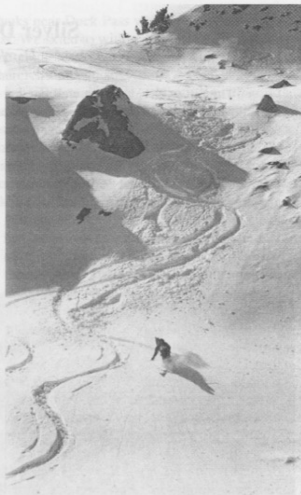
Ski run down Kaiser Ridge to George Lake