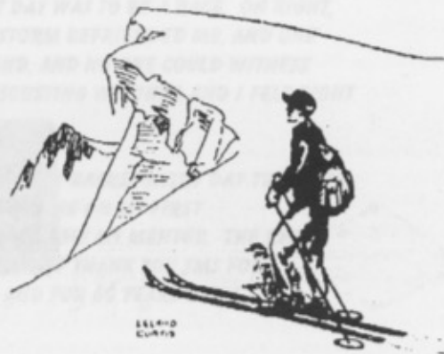
PHOTO PAGE 2

Several SMS members have alluded to a possible Sierra Snow Snake that on occasion has impeded their skiing, then obviously burrowed back into the snow before being seen. Discovering such a southernly Wigglianus would be a real triumph and almost assuredly electrify the Society of Herpetologists and the National Science Foundation. If anyone locates a specimen, which would most likely occur during the Wigglianus Spring mating season, please put it on ice and contact me via The Mugelnoos. Happy Spring skiing to all!